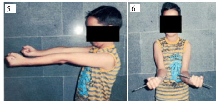
[Table/Fig-5]: Clinical photograph showing full extension at elbow.

On final follow-up at 24 weeks, 46 (92%) patients had loss of movement at forearm by less than 15 degree, 4 (8%) patients had loss of movement at forearm by 15-30 degrees and no patient had loss of movement at forearm more than 30 degrees. Similar results have been reported in literature in study by Kapoor V et al., in which 16% of patients had some loss of motion at forearm over a 24 weeks follow-up period [21].