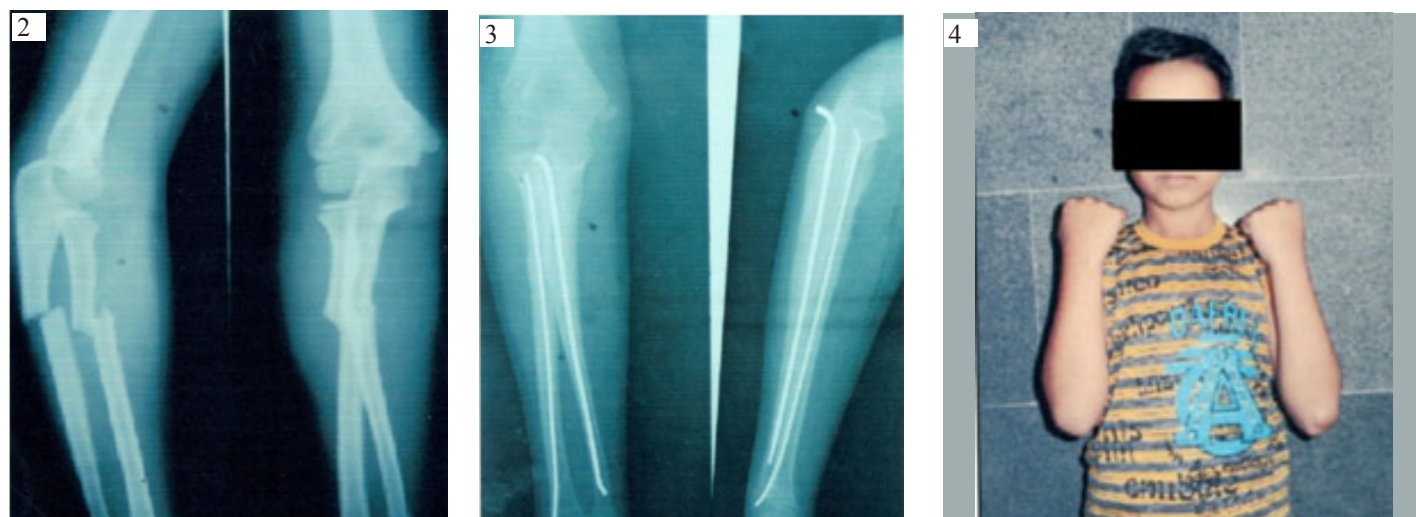
[Table/Fig-2]: Pre-operative radiograph Antero-Posterior and lateral view of fractures in both bones of forearm. [Table/Fig-3]: Post-operative radiograph Antero-posterior and lateral at 6 months showing bony union. [Table/Fig-4]: Clinical photograph showing full flexion at elbow.